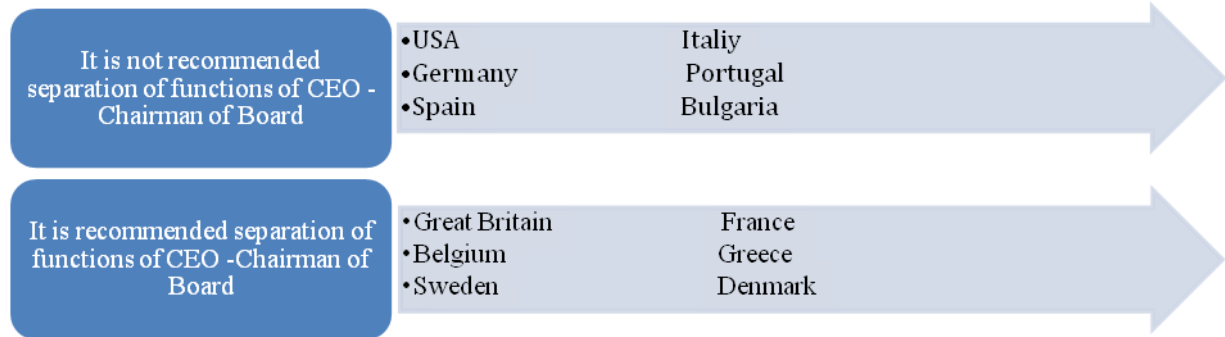
Fig. 3 Duality vs separation of functions CEO – Chairman of the Board