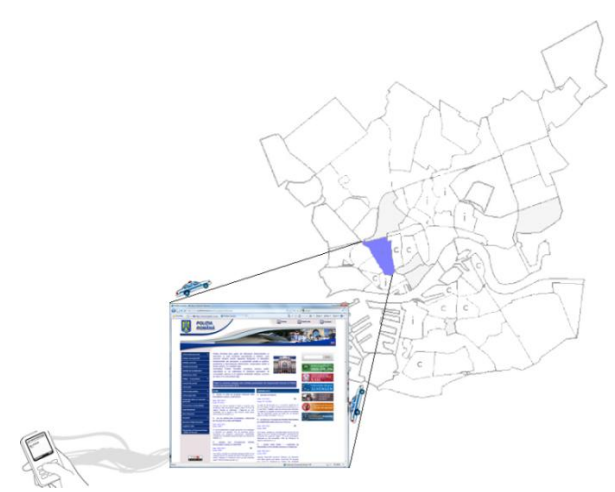
Figure 3. Interaction with the Police

At the same time the Web portal send a text message on each registered user describing the situation and requesting additional information from other witnesses who may be nearby (e.g. when a car is robed neighbors can look out the window and see some clues about the thief / thieves – sending it to the police Web portal via SMS).