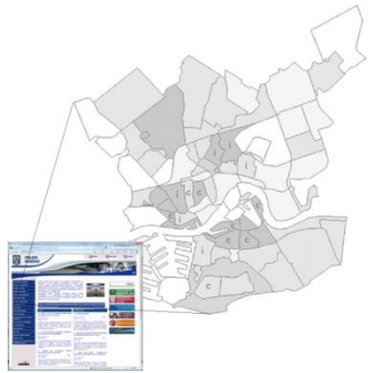
Figure 2. Interaction sectors

Police, on the basis of demographic density, will divide the area in sectors of interaction. It is not necessary that all citizens of that area to be users of the service; over time the system will attract more and more. In this section a special place are those who have a residence in another area but they work here - they should be taken into account as well because they can provide useful information.